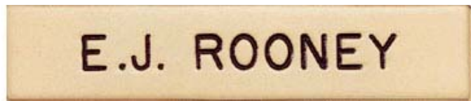
J2 - 3" x 5/8"