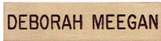
J3 - 2 1/2" x 5/8"