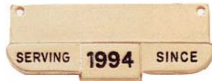
J6 - Serving Since Bar